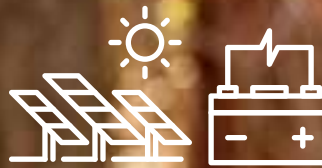
EARTH FRIENDLY SOLAR PREP