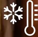
H - DUCTED A/C SYSTEM