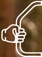
LARGE ASSIST GRAB HANDLE