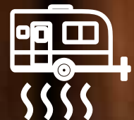
HEATED & ENCLOSED UNDERBELLY