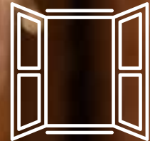
EXTRA-LARGE WINDOWS FOR CROSS-VENTILATION