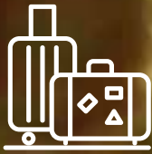
FINISHED PASS-THRU STORAGE COMPARTMENT