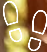
FULL WALK-ON ROOF