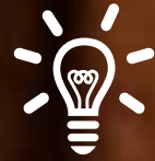
LED INTERIOR AND EXTERIOR LIGHTING